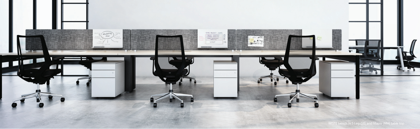
WISTE bench in S Leg (SB) and Maple (MH) table top